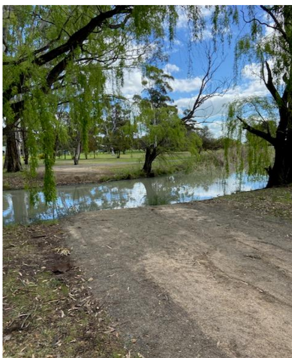
Southern end finished site