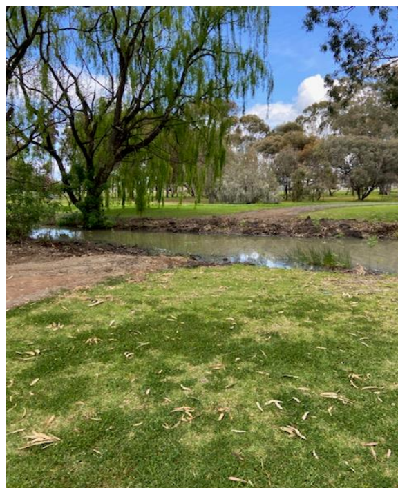
Northern end finished site