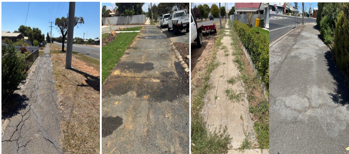
Images: Lascelles Street Hopetoun, Cromie Street Rupanyup, O'Brien Street Warracknabeal