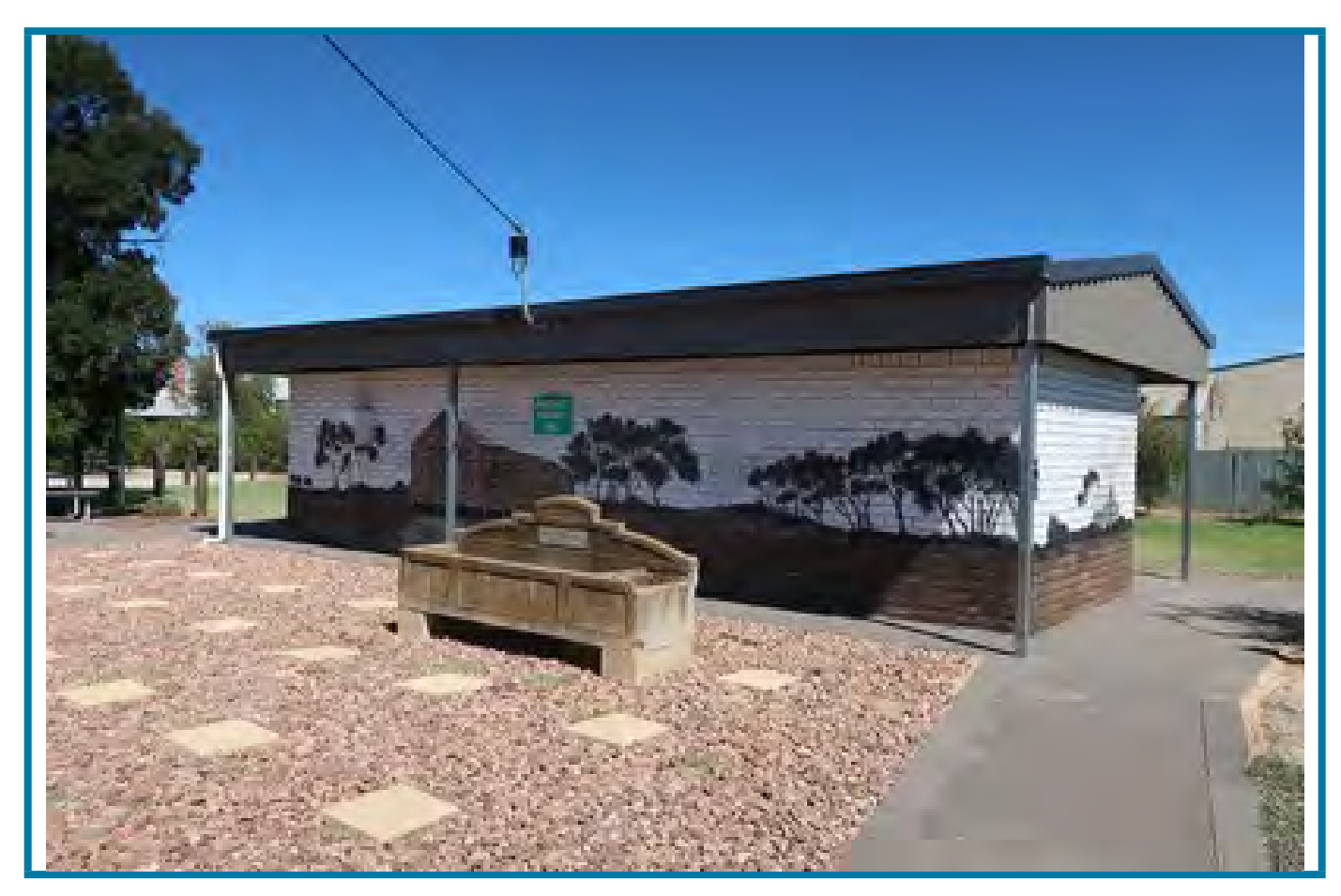
Yarriambiack Shire Council Lb92 Toilet Block & Caravan Park 16 Gloucester Avenue Woomelang Vic 3485