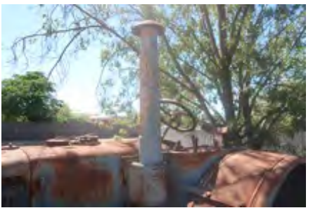
Maintain paint or sealant