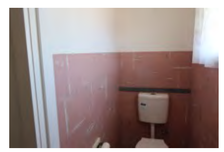
Maintain paint or sealant