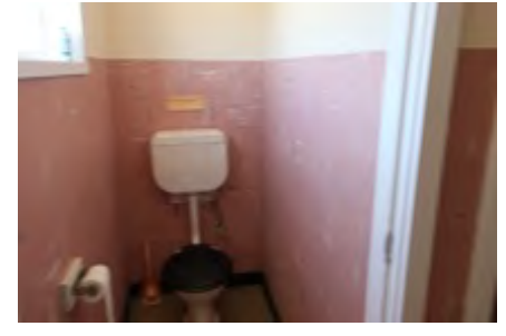
Maintain paint or sealant