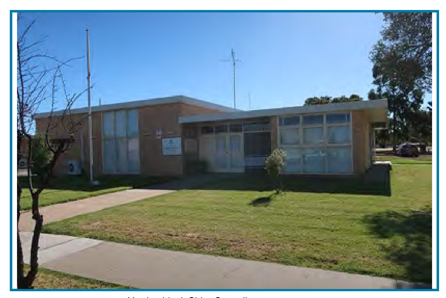
Yarriambiack Shire Council Lr15d Senior Citizens 26 Jamouneau Street Warracknabeal Vic 3393