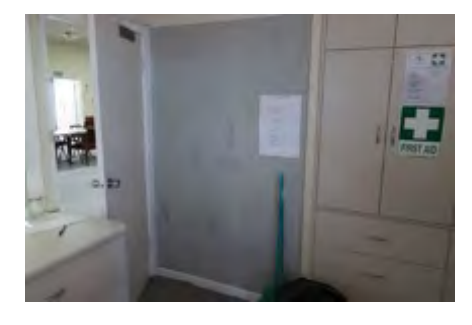
Maintain paint or sealant