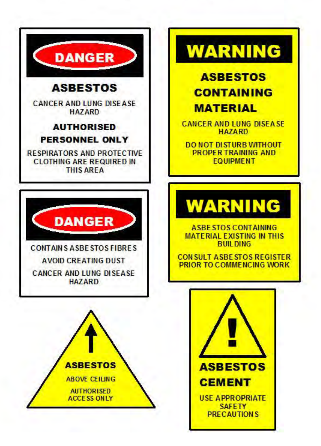
Figure 2 – Examples of warning signs and labels

In Strict Confidence: This report has been created and developed for the person's listed in the report body and is intended only for the use as detailed in the report