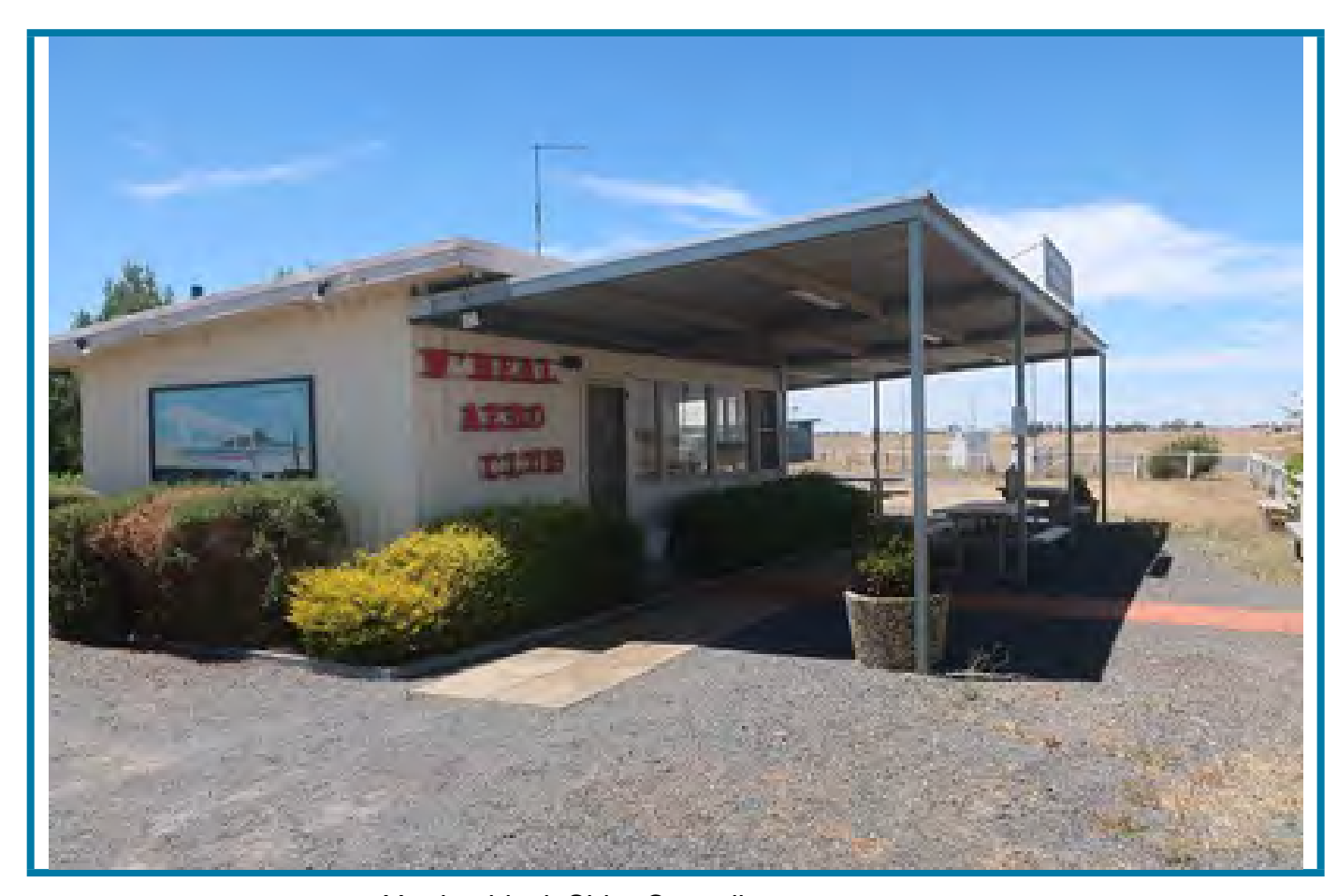
Yarriambiack Shire Council Lb8 Aerodrome 4936 Henty Highway Warracknabeal Vic 3393