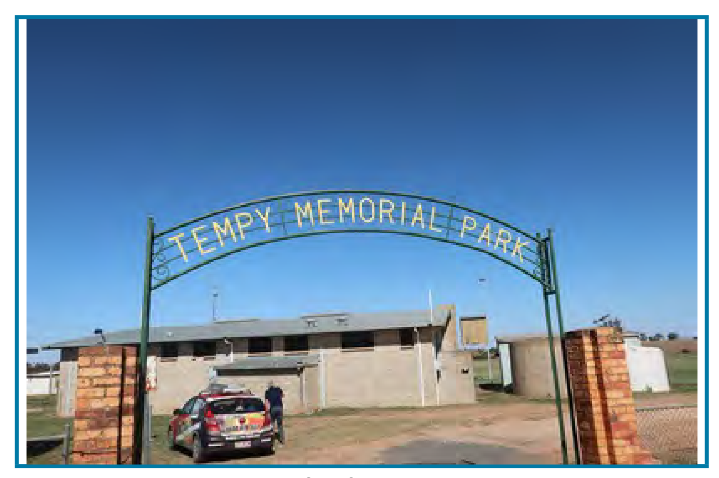
Yarriambiack Shire Council Lb25 Memorial Park Pavillion 2 Station Street Tempy Vic 3489