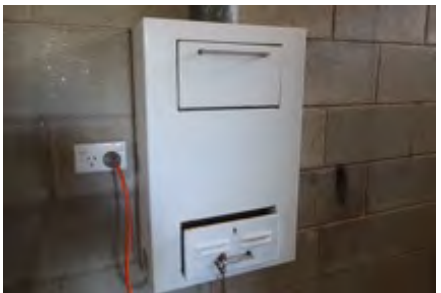
Maintain seal Maintain seal