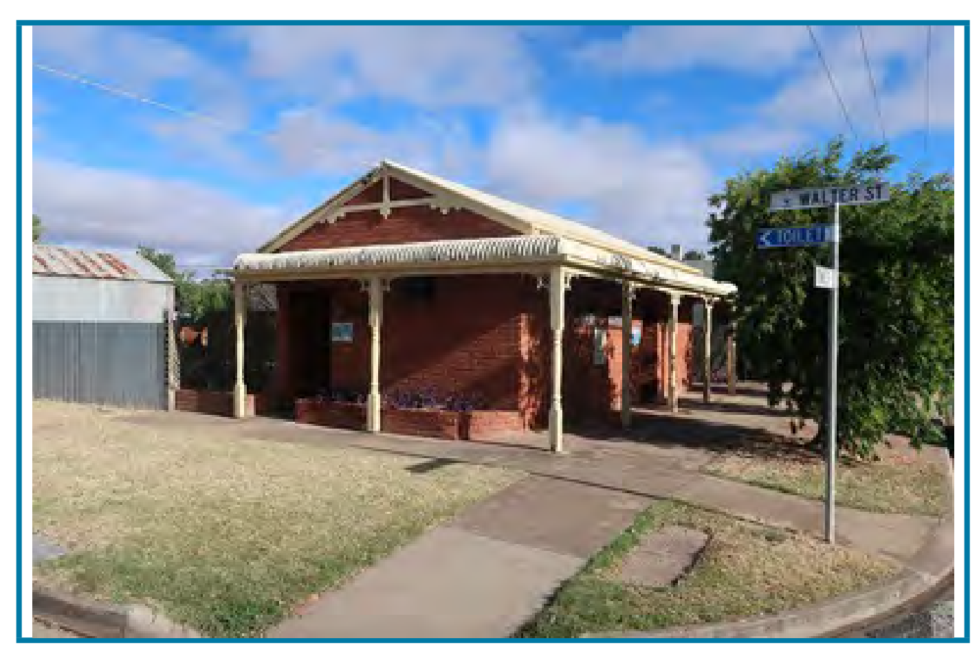
Yarriambiack Shire Council Lb37b Toilet Block 18 Cromie Street Rupanyup Vic 3388