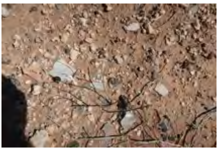
Debris on Surface