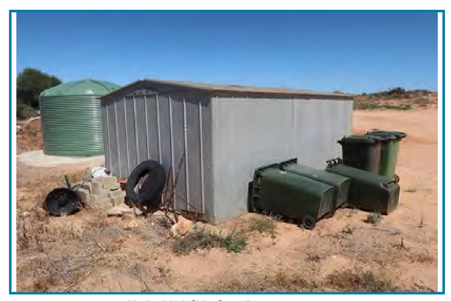
Yarriambiack Shire Council Lr29 Rubbish Tip 38 Patchewollock Tip Road Patchewollock Vic 3491