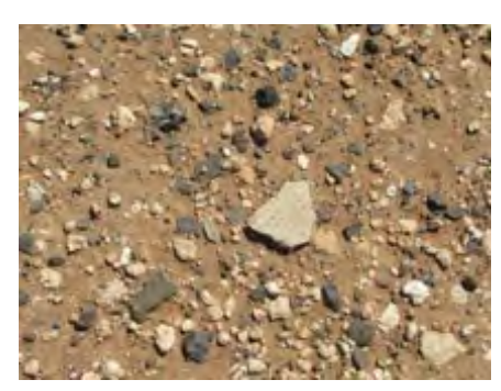
Debris on Surface Debris on Surface Debris on Surface