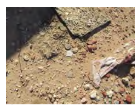
Debris on Surface Debris on Surface Debris on Surface