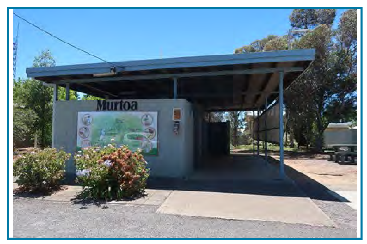
Yarriambiack Shire Council Lb82 Toilet Block 34-36 Marma Street Murtoa Vic 3390