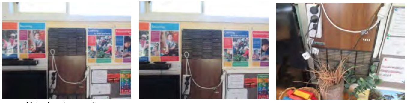
Maintain paint or sealant