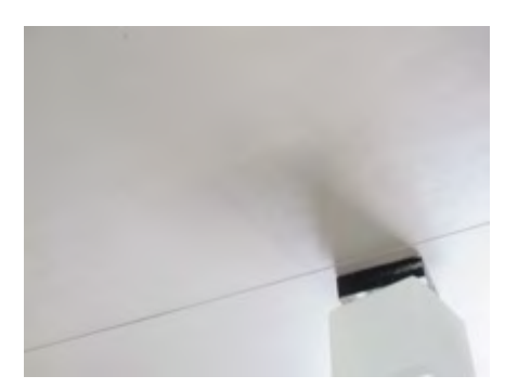
Maintain paint or sealant