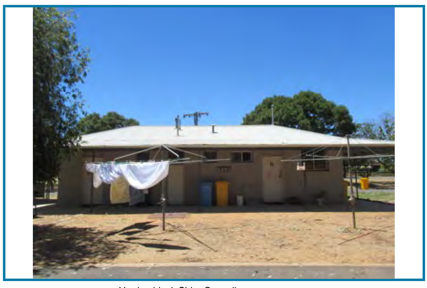
Yarriambiack Shire Council Lr2b Caravan Park 48 Lake Street Murtoa Vic 3390