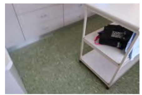
Maintain paint or sealant