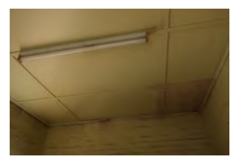
Maintain paint or sealant