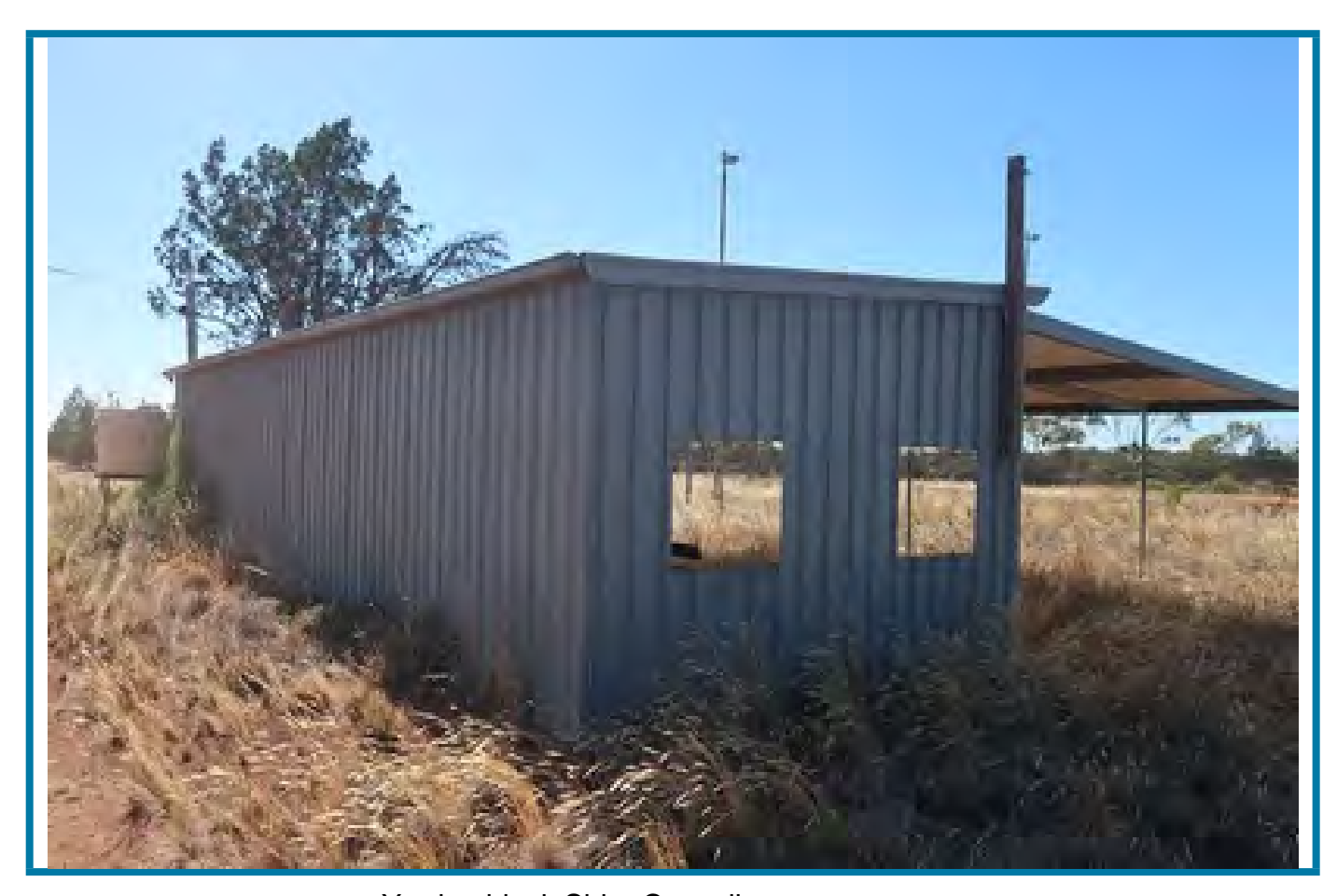
Yarriambiack Shire Council Lb98 Tennis Courts / Recreation Cicely Street Lascelles Vic 3482