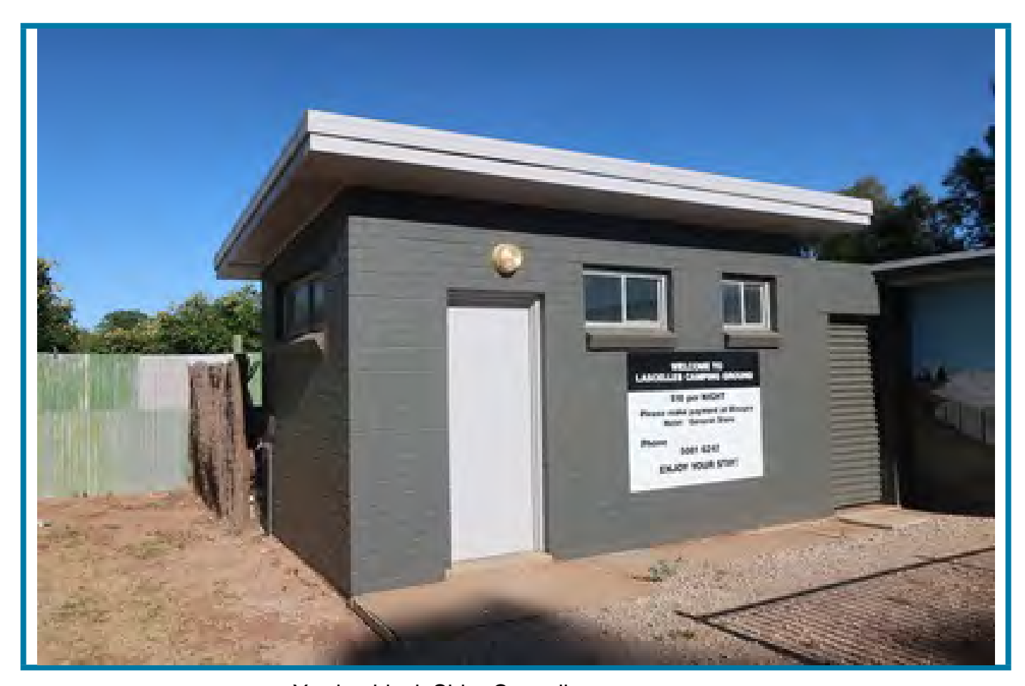
Yarriambiack Shire Council Lb76 & 81 Caravan Park 20-26 Wychunga Street Lascelles Vic 3482