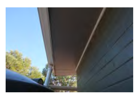
Maintain paint or sealant