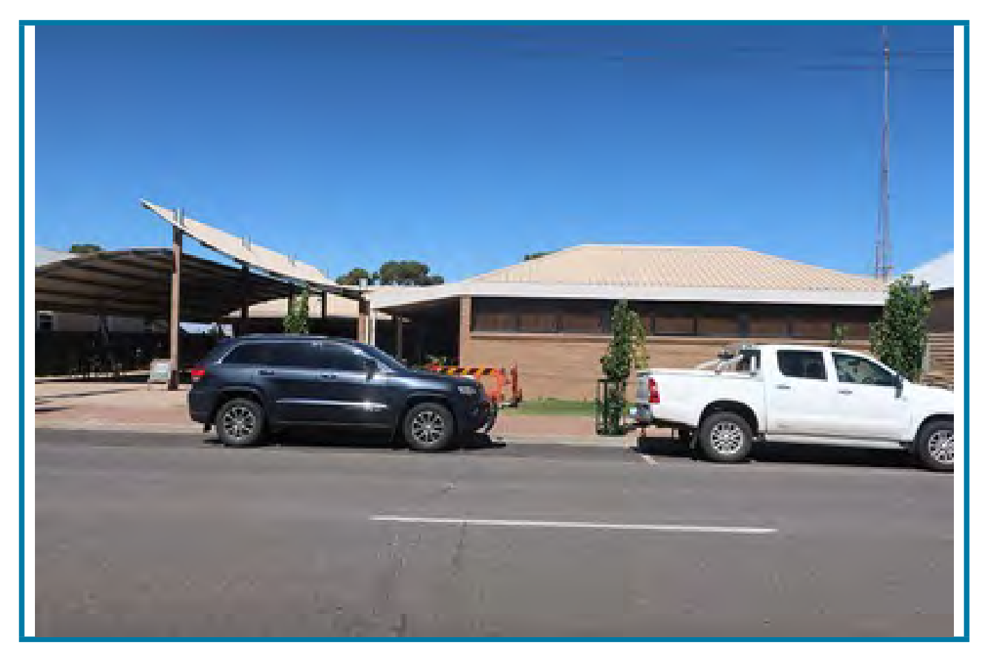
Yarriambiack Shire Council Lb60 Shire Offices 75 Lascelles Street Hopetoun Vic 3396