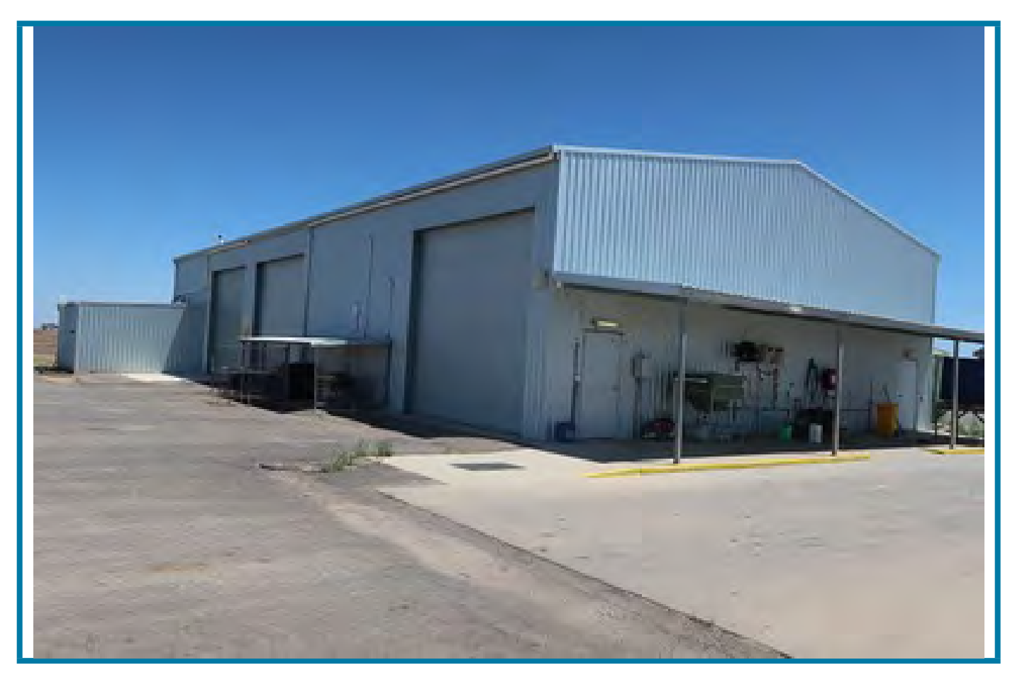
Yarriambiack Shire Council Lb82 Shire Depot 68 Hopetoun Aerodrome Road Hopetoun Vic 3396