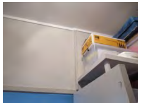
Maintain paint or sealant