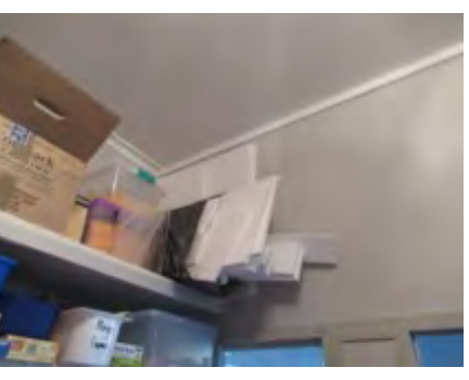
Maintain paint or sealant