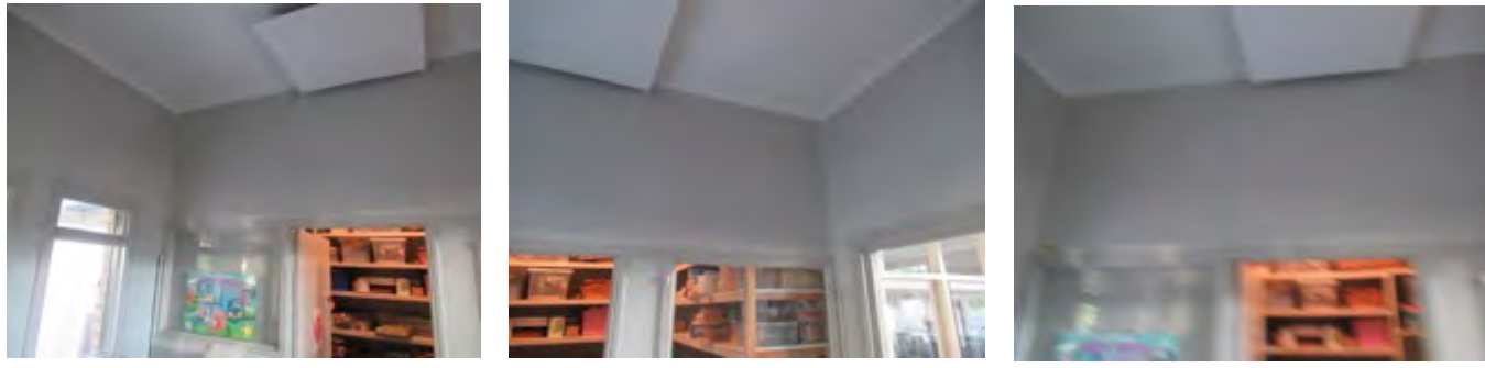
Maintain paint or sealant