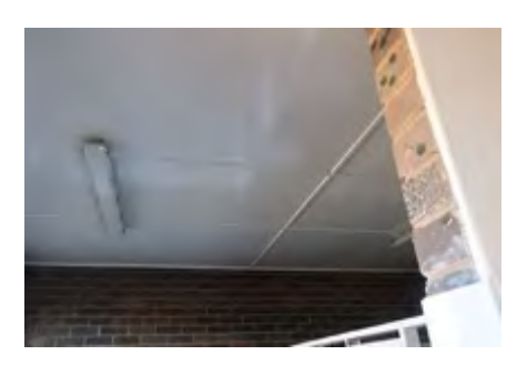
Maintain paint or sealant