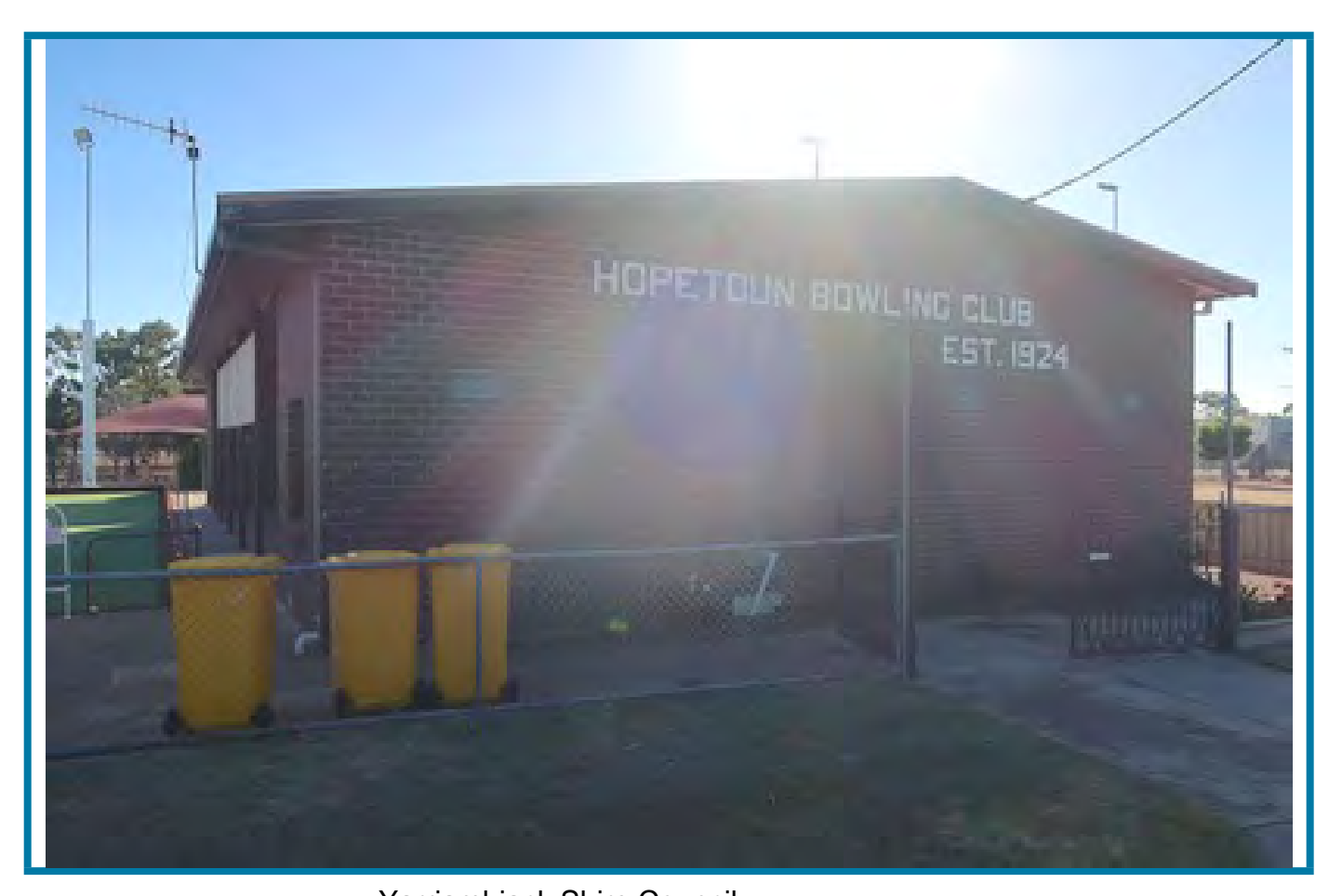
Yarriambiack Shire Council Lb58b Bowling Club 4 Austin Street And 54 Evelyn Street Hopetoun Vic 3396