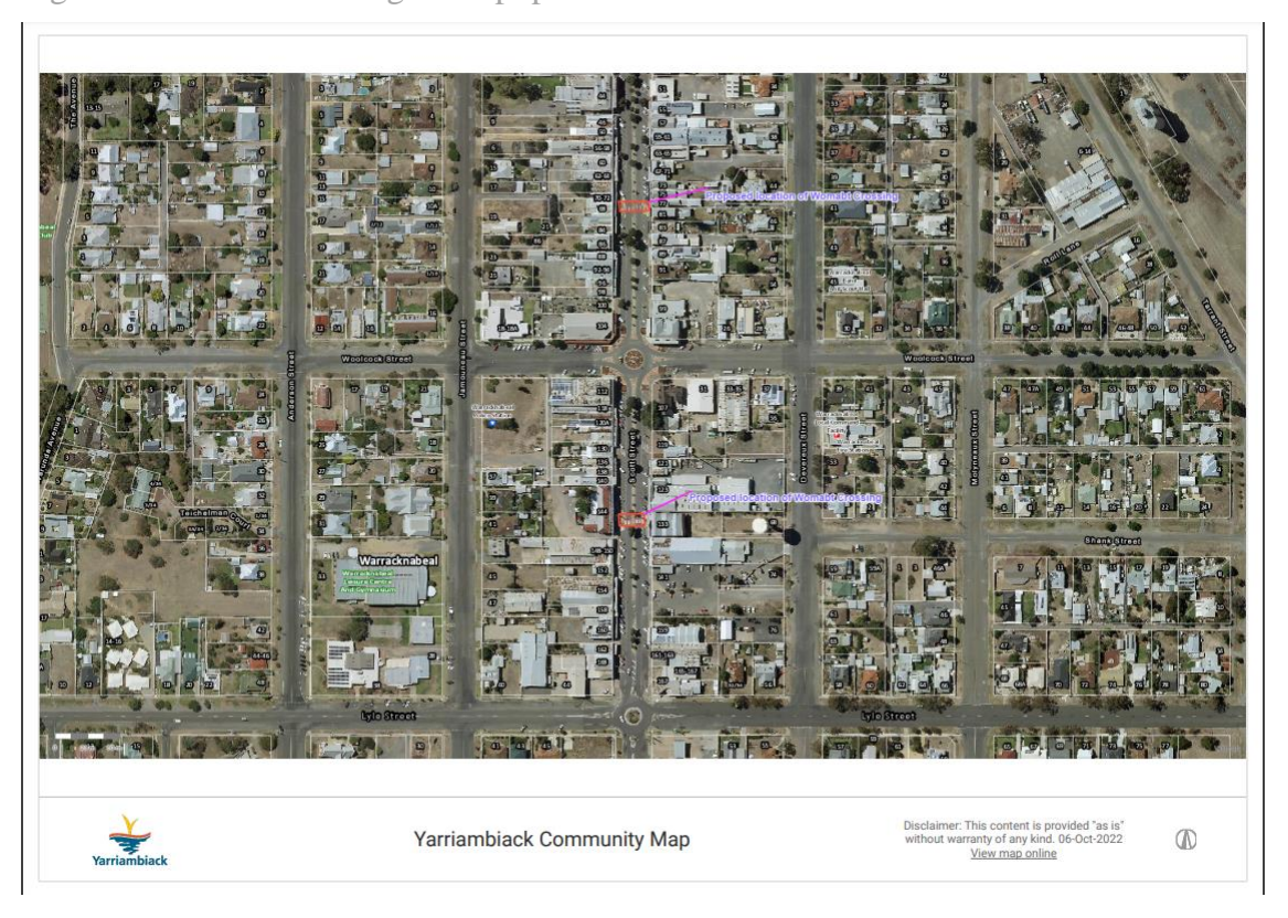
Figure 2 Location of proposed wombat crossings