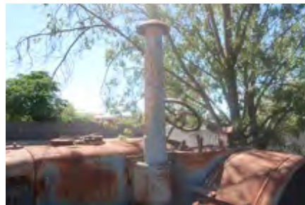
Maintain paint or sealant