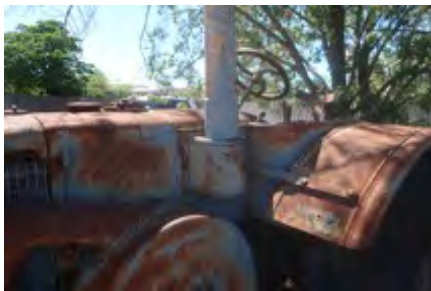
Maintain paint or sealant