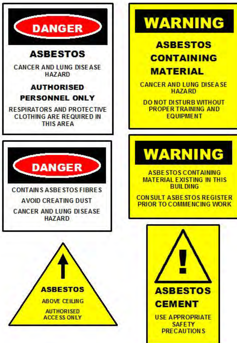
Figure 2 – Examples of warning signs and labels

Note: The examples of warning signs and labels in Figure 2 provide only an indication of the words that may be used to alert persons to the presence of ACM and asbestos hazards. The wording is not mandatory. Other warning signs and labels may be used, provided they meet the requirements of AS 1319.