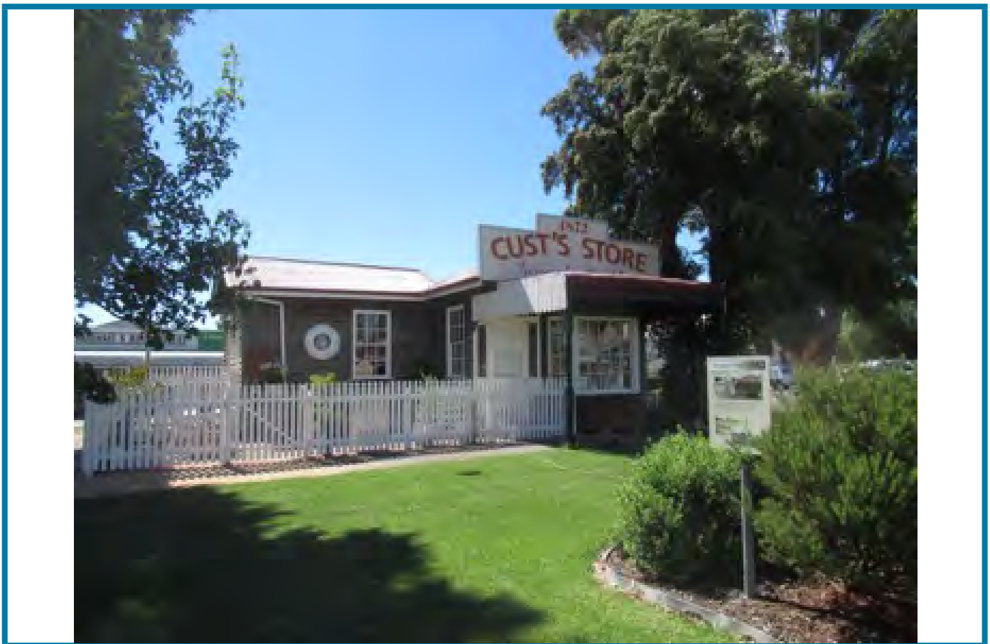
Yarriambiack Shire Council Lr46 Cust Store 27a Cromie Street (in Middle Of Road) Rupanyup Vic 3388