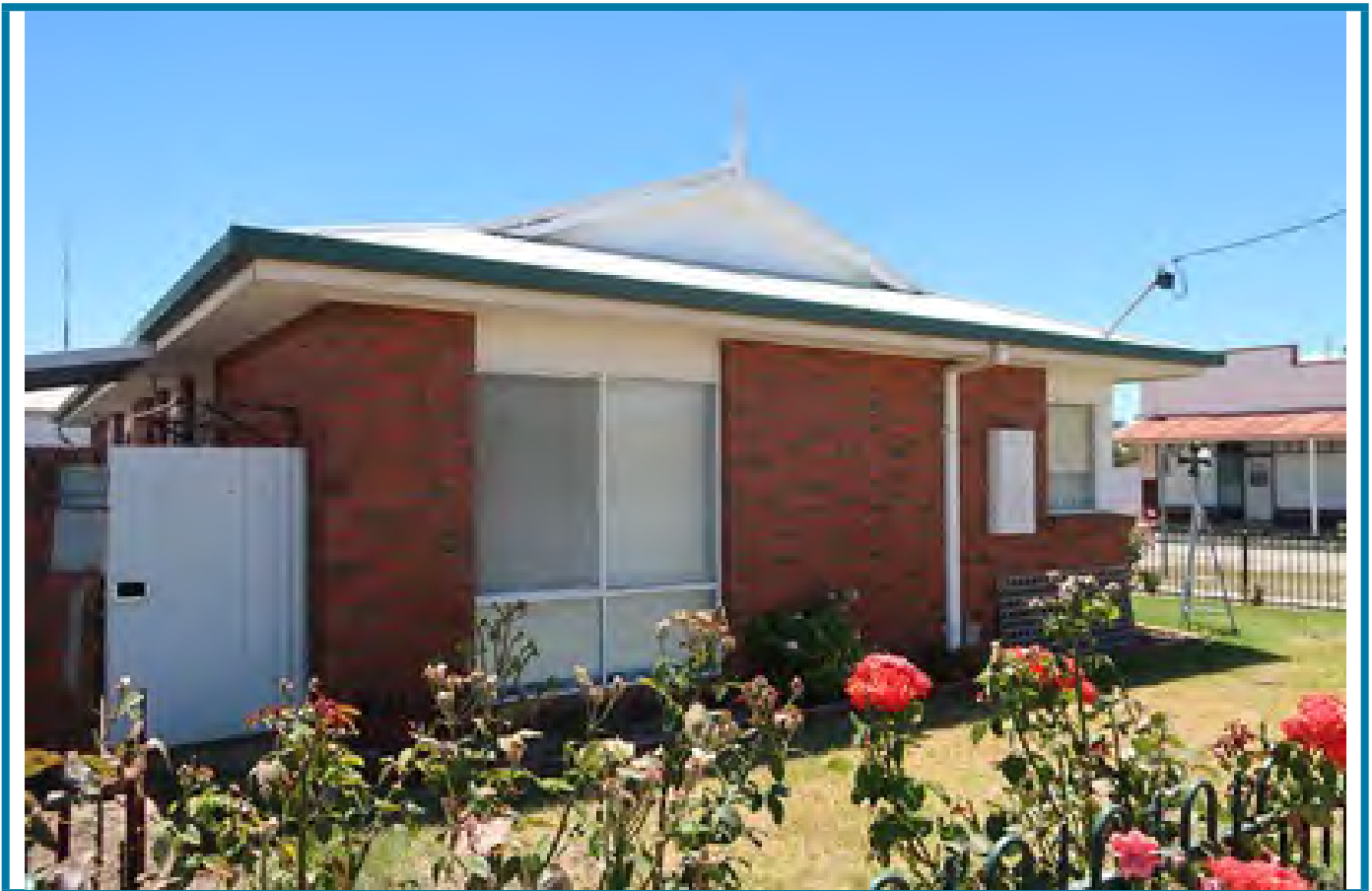
Yarriambiack Shire Council Lb56 Unit 1 1/42 Mcdonald Street Murtoa Vic 3390