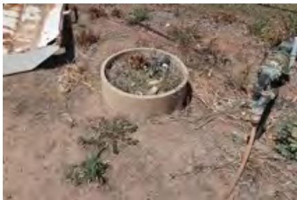
Garden beds (unusable)