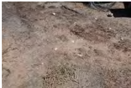
Debris on Ground