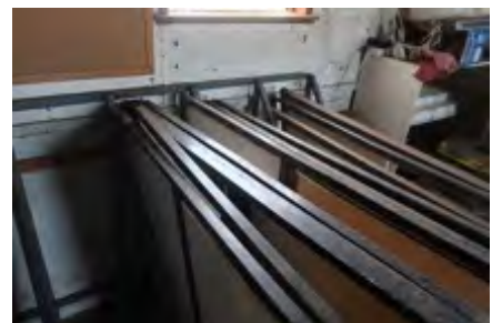
Maintain paint or sealant