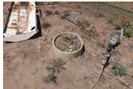
Garden beds (unusable)