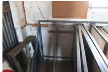
Maintain paint or sealant