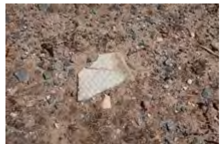
Debris on Surface