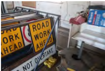
Maintain paint or sealant