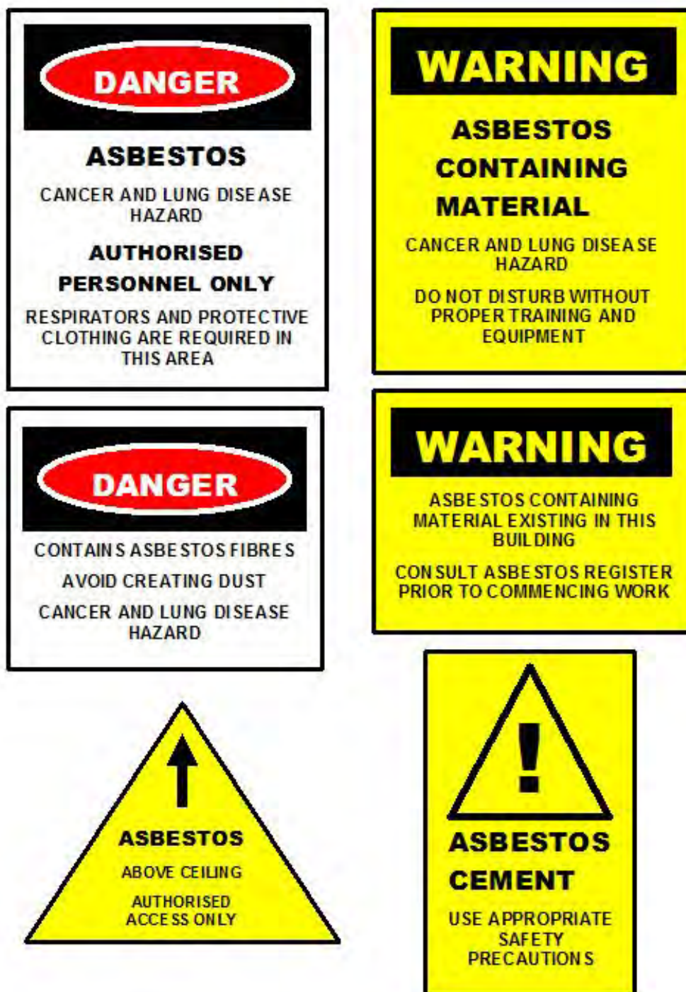
Figure 2 – Examples of warning signs and labels

Note: The examples of warning signs and labels in Figure 2 provide only an indication of the words that may be used to alert persons to the presence of ACM and asbestos hazards. The wording is not mandatory. Other warning signs and labels may be used, provided they meet the requirements of AS 1319.