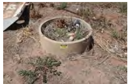
Garden beds (unusable)