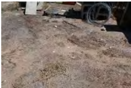
Debris on Ground